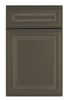
Devonshire II Flat Panel Urbane Bronze w/ White