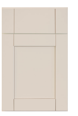
Nantucket II Khaki w/ Brown