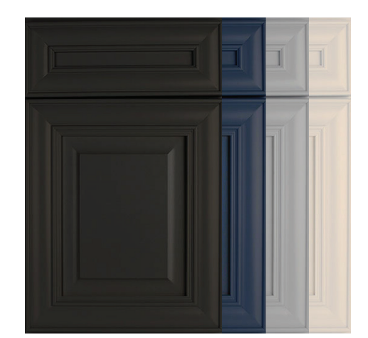
*All doors shown are Devonshire II Raised Panel.